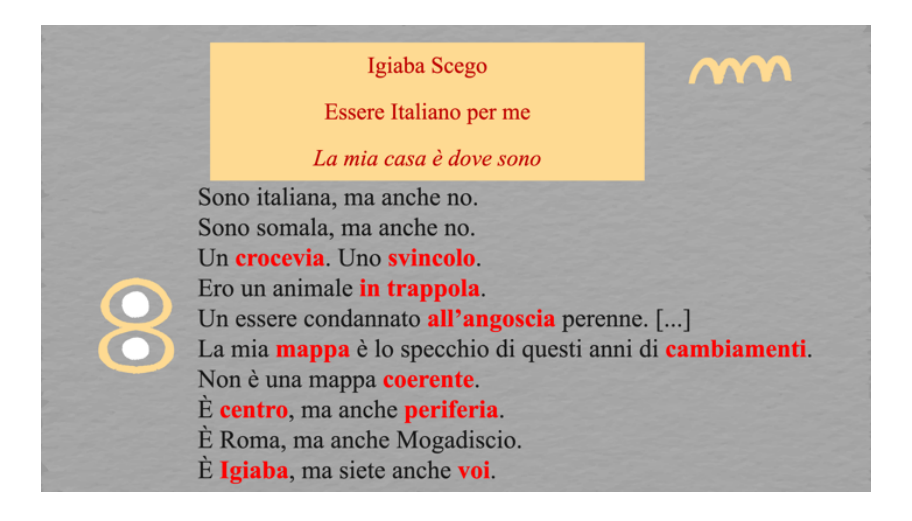
Figure 6 Igiaba Scego Exercise Part 1